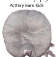
Pottery Barn Kids